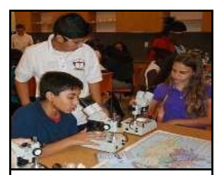
The Nature Classroom Program provides experiential instruction and activities to educate, excite and involve the students in science.