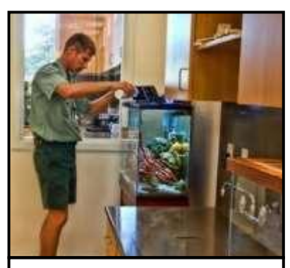
The Discovery Lab provides Park Specialists, Rangers, Researchers, Interns and Volunteers with a great work and research facility.