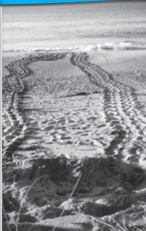
A loggerhead turtle crawl

A Turtle Walk is a fantastic educational program led by a Park Ranger for people of all ages to learn about the Florida sea turtles and to observe a loggerhead turtle's nesting habits. Watch them crawl up the beach and dig their nests out of the sand. See how they place their eggs in the nest and return to the sea. Learn how to do your part to keep them safe, happy, and willing to return to our beaches.