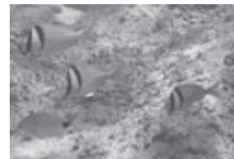
Porgyfish belong to the Grunt family. They have distinctive black bars on the head and yellow stripes on the body. They are common at the Park's reef.