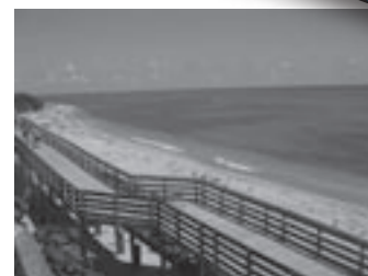
If it's sunny calm day, the visibility is usually good.

Another thing to be careful of is tides and currents. You may get scraped by the reef if you attempt to snorkel in shallow water—the reef can be sharp. To see the reef more easily, high tide is better than low tide. Please be aware that stepping on or grabbing the rocks will kill these delicate marine organisms. Go with respect and have fun!