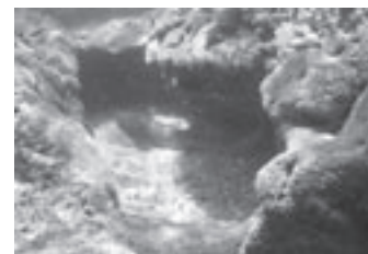
Nurse sharks are normally harmless and stay at the bottom, feeding mostly at night on crustaceans, small stingrays, sea urchins, squid, and bony fishes.