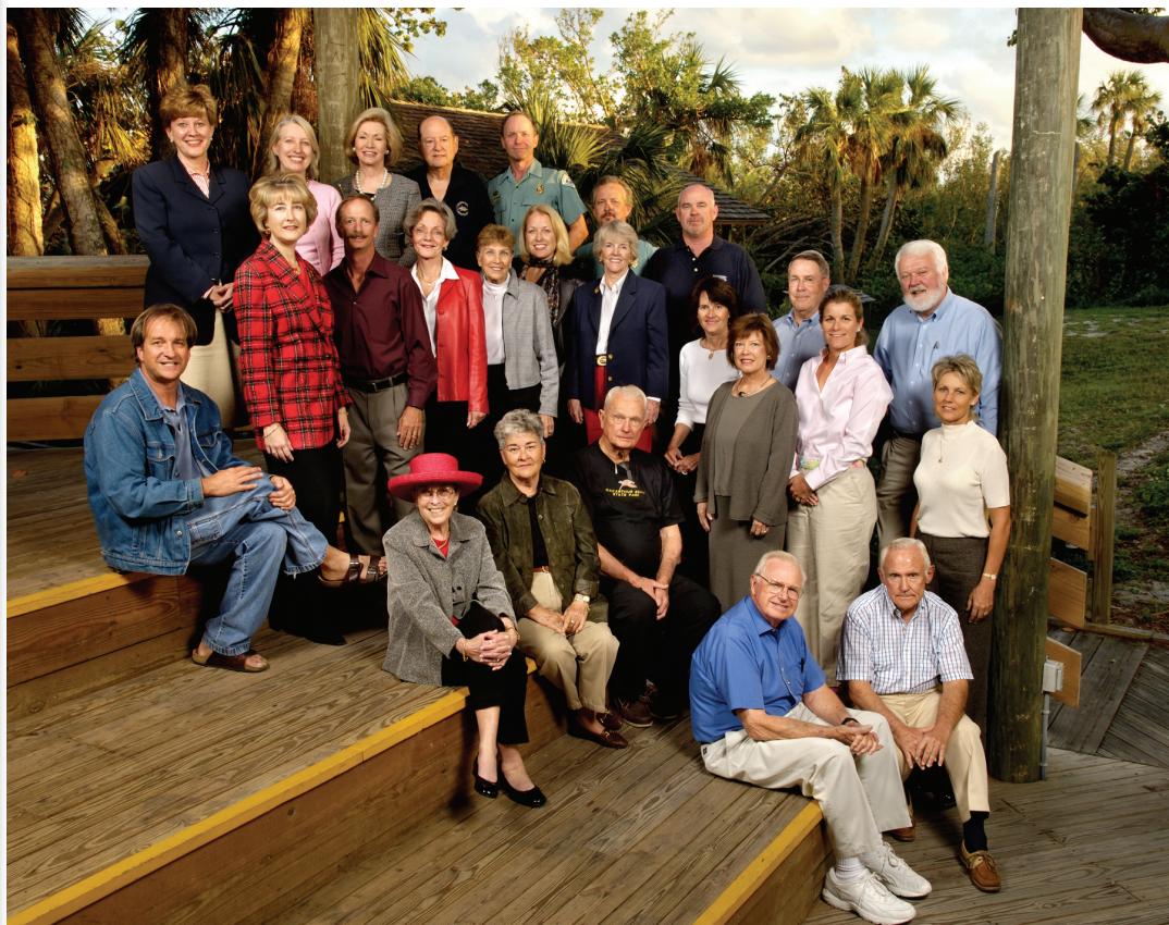
John D. MacArthur Beach State Park Board of Directors